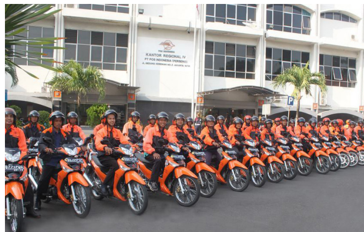
Above: PT POS employs over 70,000 staff.

Kinesis is set to replicate the meaningful economic impact of this nationwide financial provision across other financially underserved economies of Southeast Asia; targeting our important efforts next at the unbanked populations of Sub-Saharan Africa and Latin-America.